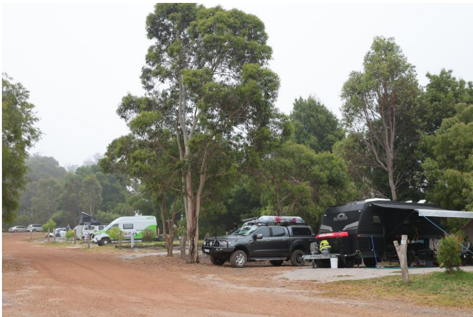
Sites 19 -M1

The campground offers a relaxed farm-stay camping experience with large powered and unpowered sites suitable for caravans, motorhomes, camper trailers and tents. Guests are encouraged to enjoy the natural environment, meet our farm animals, participate in daily sheep feeding and explore the surrounding Margaret River region.