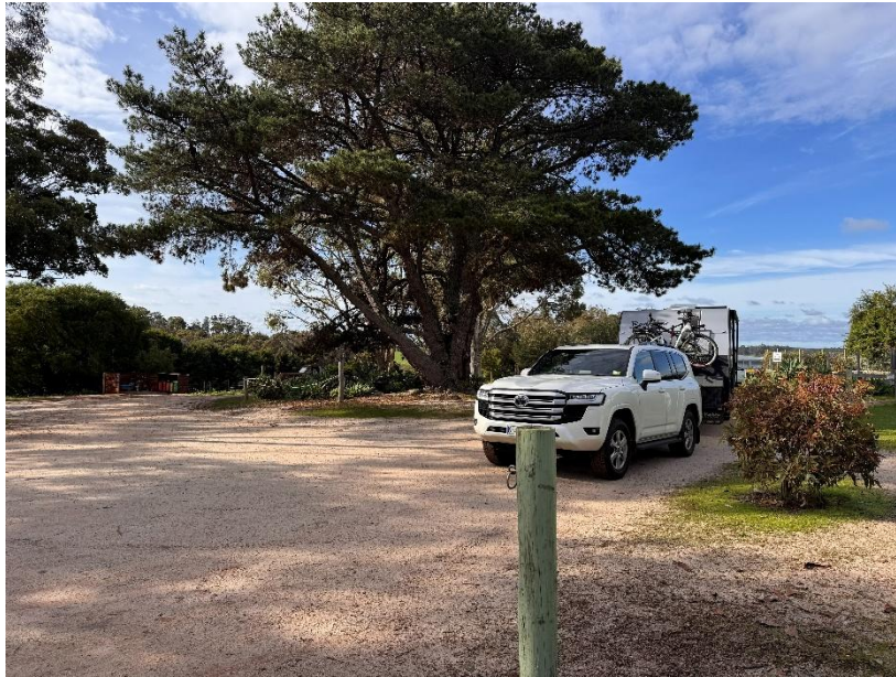
Office check in parking / turn around

If a guest is unable to access the office, staff can assist with check-in outside the office or at an alternative location within the campground.