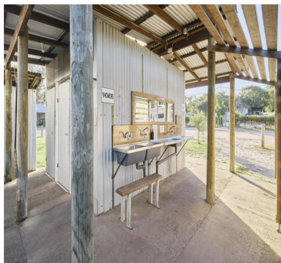
Main Camp shed and toilet/ Shower block